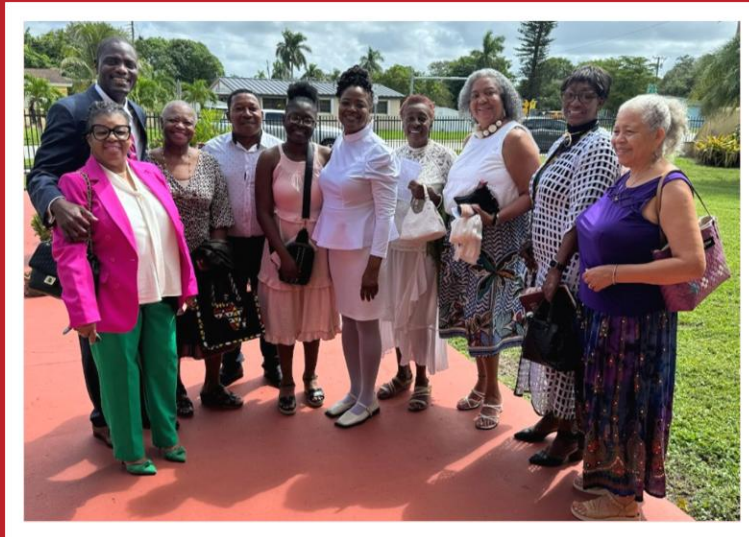
World Communion Sunday at Myrtle Grove