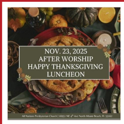
Thanksgiving Fellowship Meal